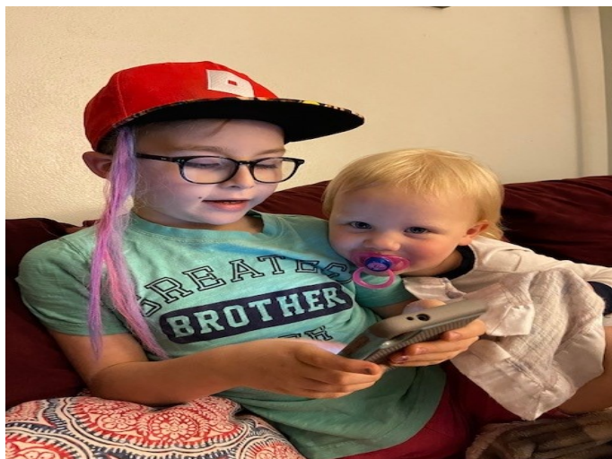
Snuggling/hugging her brother, watching what he is doing and having fun interacting with him.