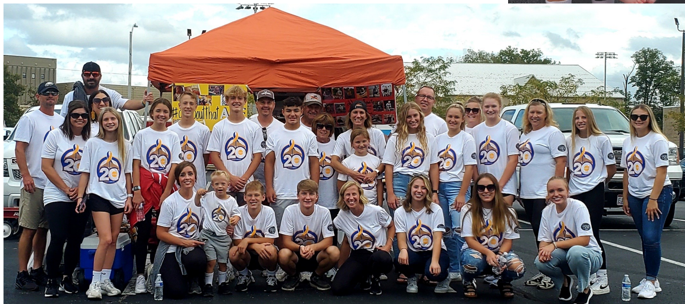
Ace had 157 registered walkers with him and raised $3,000 for Down Syndrome Association of Great Toledo.