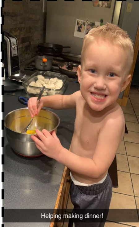
Helping making dinner!