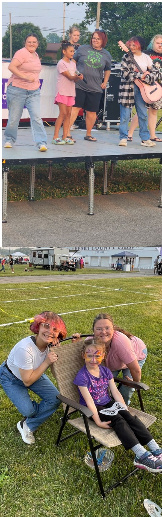
Henry County Special Olympics Relay for Life Team