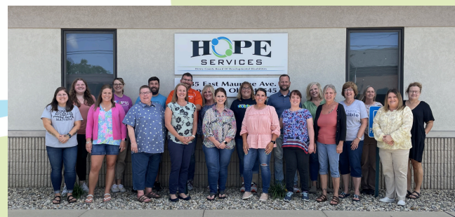
HOPE Services Earns 3 Year Accreditation